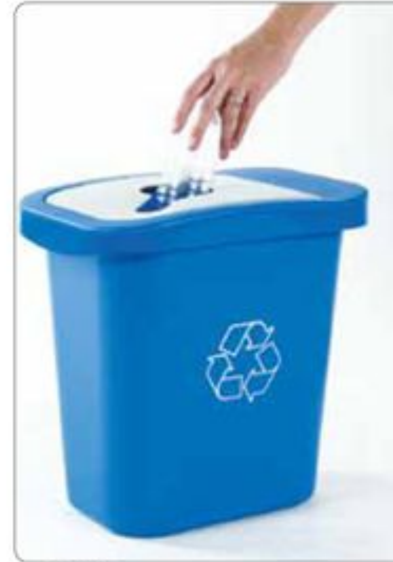
Billi Box 2 sizes available, the ultimate solution for classrooms